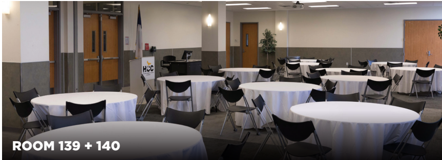
ROOM 139 + 140